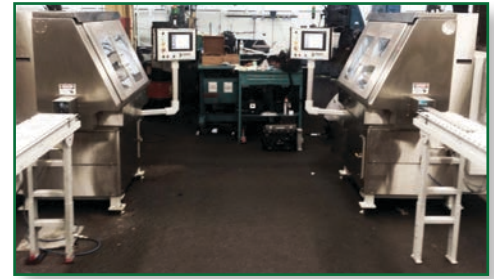
Right or Left Hand Feed for Work Cells