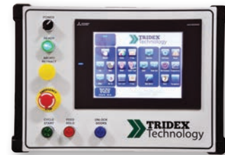
Intuitive User Interface with Color Touch Screen