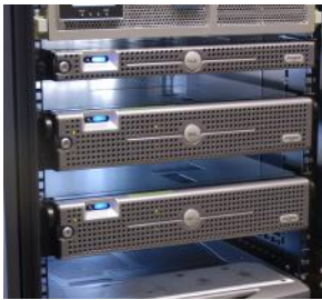
Interface to HIS and PACS