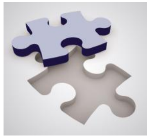
Modular design to suit various medical fields