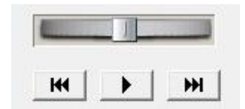
VCache – simple editing of long video-sequences