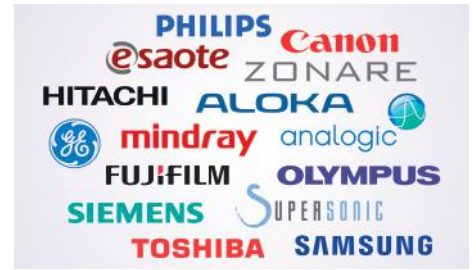
Data acquisition from devices of any manufacturer