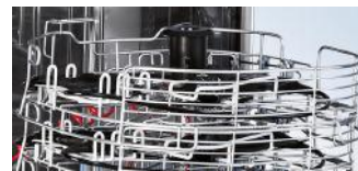
EndoClean – store cleaning protocols