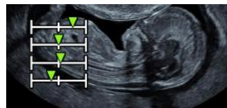
Prenatal diagnostics – display measured data graphically