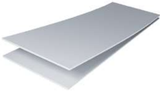
Nonwoven Polypropylene Non adherent Silicone

Polymesh Dual is composed of double sides with different properties for implantation in intra-peritoneal site.