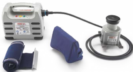
A03-01-000 ROSC-U™ Mechanical CPR System