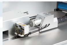
Product Fixture with Quick Release

The machine is equipped with a PLC control, a PC with touch screen and the user-friendly BW-TEC HMI. Process parameters for individual products can be stored in separate recipes. Due to the network compatibility a connection to production databases can be made possible. The machine meets the highest safety requirements.