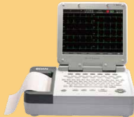
SE-12 Express Electrocardiograph