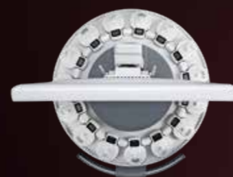
FTS-6 Central Monitoring System