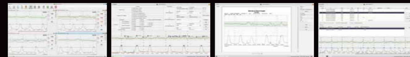
Monitoring information display

The FTS-6 multi-display mode allows caretakers to work through with patients easier and faster. Meanwhile, the nationally standardized NICHD analysis program together with CTG analysis are preprogrammed in the system. Flexible report edit function fits in user's working experiences and preferences.