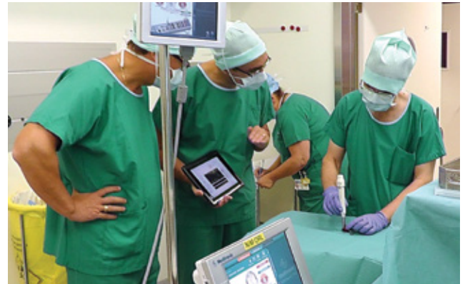
Ex-vivo malignancy verification

RadPointer® system consists of hand-held, compact, wireless probe and proprietary software installable on any PC.