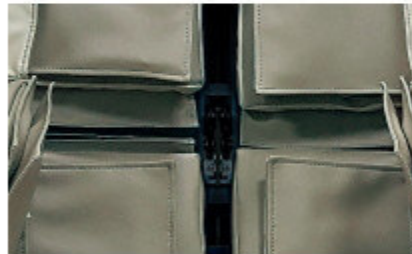
BODY TYPE MEASURING FUNCTION - Anyone can easily get information by measuring spine / posture.

Medical Effects are Intelligently Developed