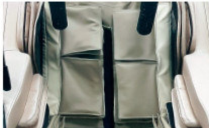
CORRECTION / RELAXATION FUNCTION - Corrects the wrong spine and relax muscles.