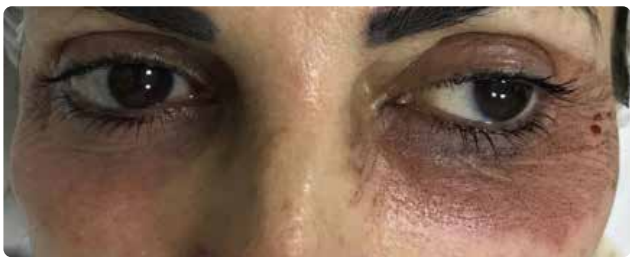
Right after Treatment