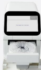
2. Insert disc