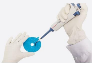
1. Add sample & diluent

From sample to complete results in 3 simple steps in approximately 13 minutes