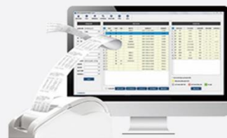
3. Read results