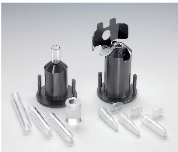
Figure 2: Unmatched sample format flexibility – from 35 mm Petri dishes to microcentrifuge tubes or standard luminescence tubes (picture includes optional accessories).

Full compatibility with a wide range of applications