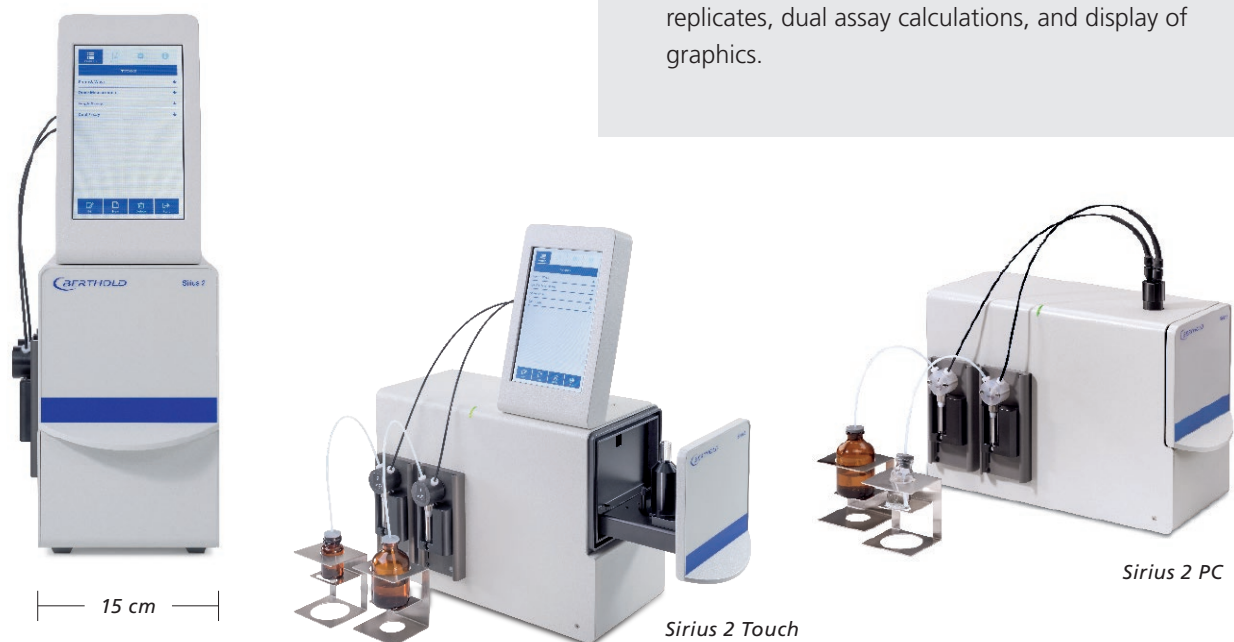
Figure 1: The Sirius 2 requires only minimal bench space. Sirius 2 in Touch-configuration (at centre) and PC-configuration (right). The touchscreen can be positioned in different ways to maximise your convenience.