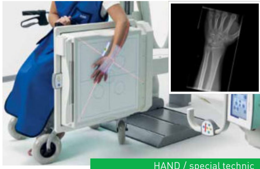
HAND / special technic