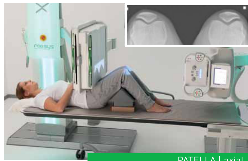
PATELLA | axial