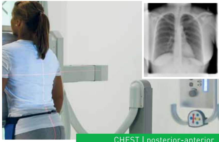
CHEST | posterior-anterior