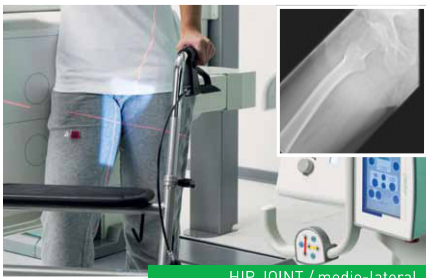
HIP JOINT / medio-lateral