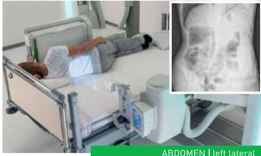
ABDOMEN | left lateral