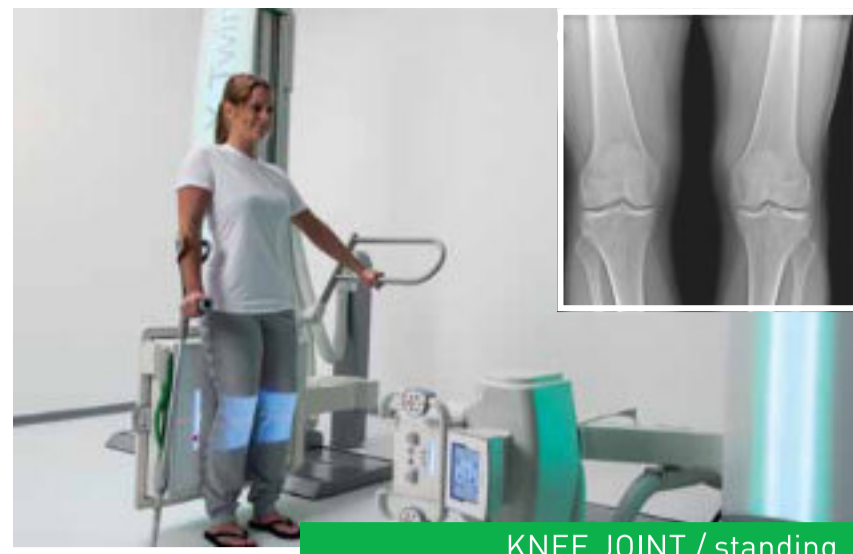
KNEE JOINT | standing