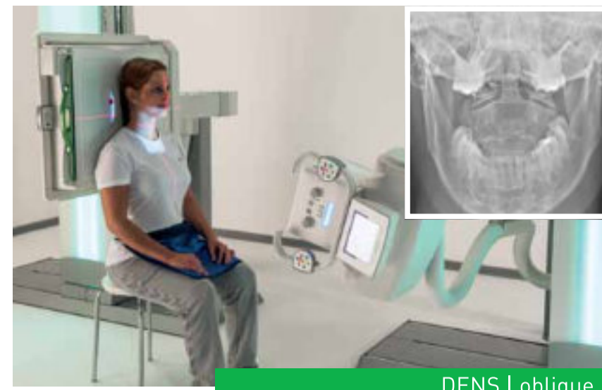
DENS | oblique