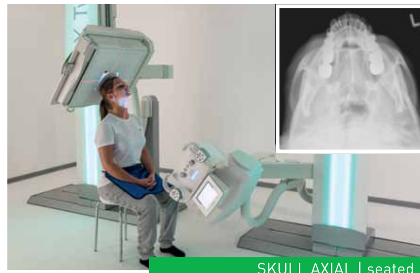
SKULL AXIAL | seated