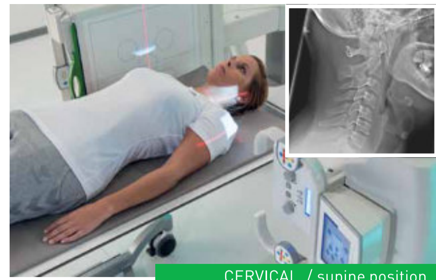
CERVICAL / supine position