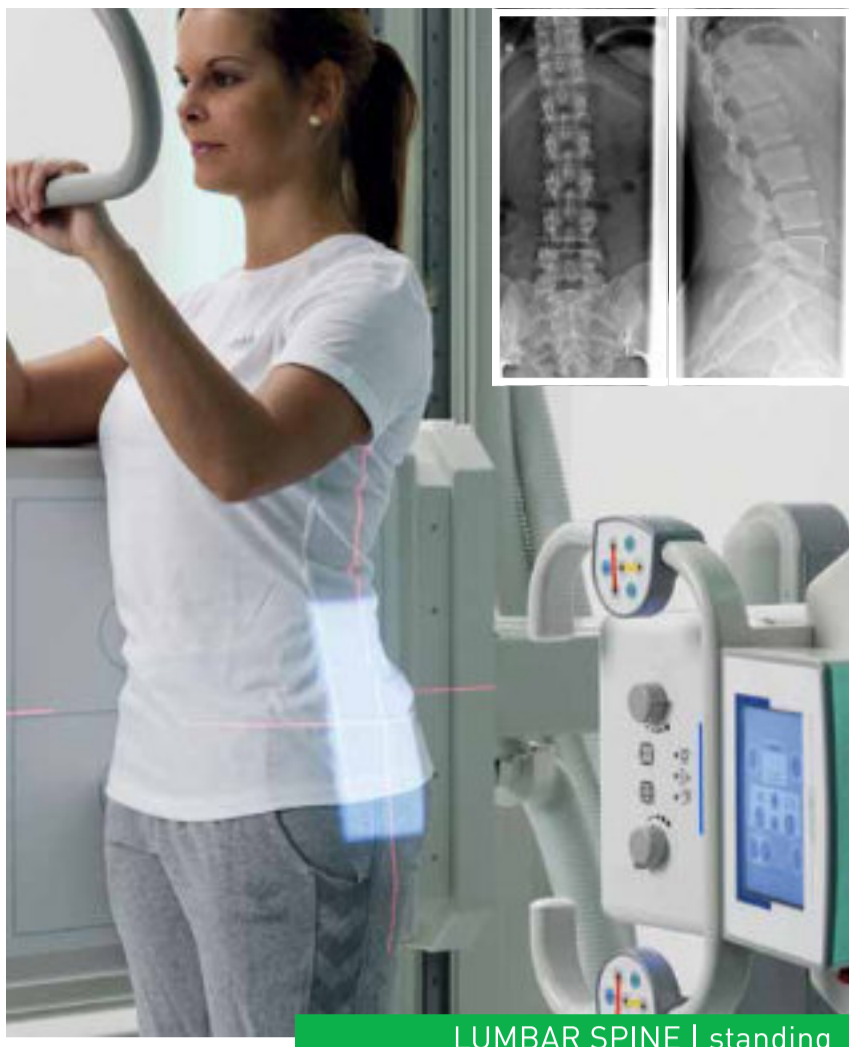
LUMBAR SPINE | standing