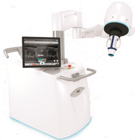
Ultrasound treatment robot

We design, develop and manufacture miniaturized and complex products for our worldwide medical device partners