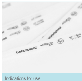
Indications for use