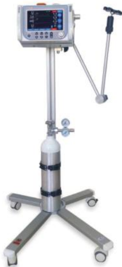
Ventilator Cart with tube holder