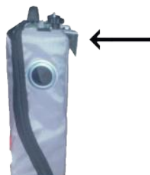
Patient Bed or Stretcher Hidden Bracket