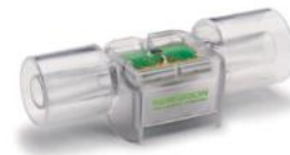
Neonatal Flow Sensor