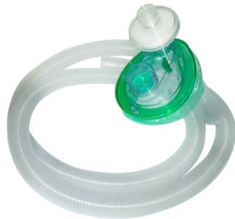
MASKS AND KIT