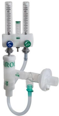
VENTURI FLOW GENERATOR