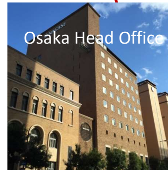
Osaka Head Office

Headquarters : Tokyo, Osaka / Japan Founded : June 1832 Employees : approx. 7,000 Subsidiaries : 102 Sales(FY2020) : US$ 7.8 billion