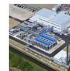
Functional Saccharide Plant (Trehalose)

Hayashibara Co., Ltd. Headquarter in Okayama