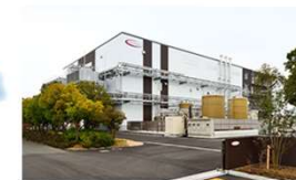
Okayama Plant I