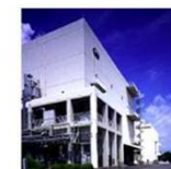
Okayama Plant II (AA2G™, Pullulan, Maltose and Enzymes)