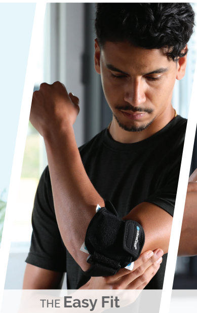
THE Easy Fit